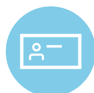
Acceptable Photo ID