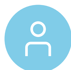
Appearance on Test Day

When you check in on test day, the testing staff will match their roster, which includes photos, to your appearance, ID, and the information on your admission ticket.